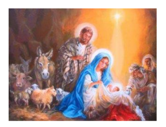
Joy to the World!